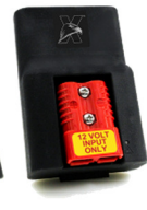
12V Power Adapter