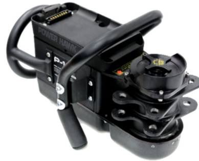
P-16X™ Cordless Components & New Front Handle