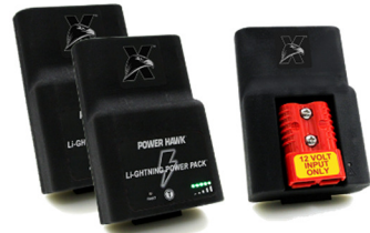
Li-GHTNING POWER PACK™ (x2)