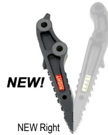
NEW! Right Spreader Arm