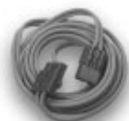
Jumper and extension cables.