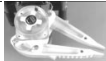
PATENTED 70° PIVOTING POWER HEAD

Cutting Force: 45,000 + lbs. (200 kN) at notch 21,000 + lbs. (93.4kN) at blade center Spreading Force: 10,000 to 18,000 lbs. (44.5 - 80.1 kN) Weight: 46 lbs. (20.8 kg.) Envelope (L x W x H): 28" x 10" x 12" (71 x 25.4 x 30.5 cm 3 ) Opening Distance: 10 in. (25.4 cm)