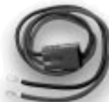
Harness for direct vehicle hook-up